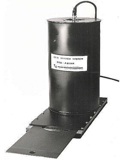
STANDARD DRAWER SYSTEM NO SHIELDING BENCH TOP STG-ABS-44